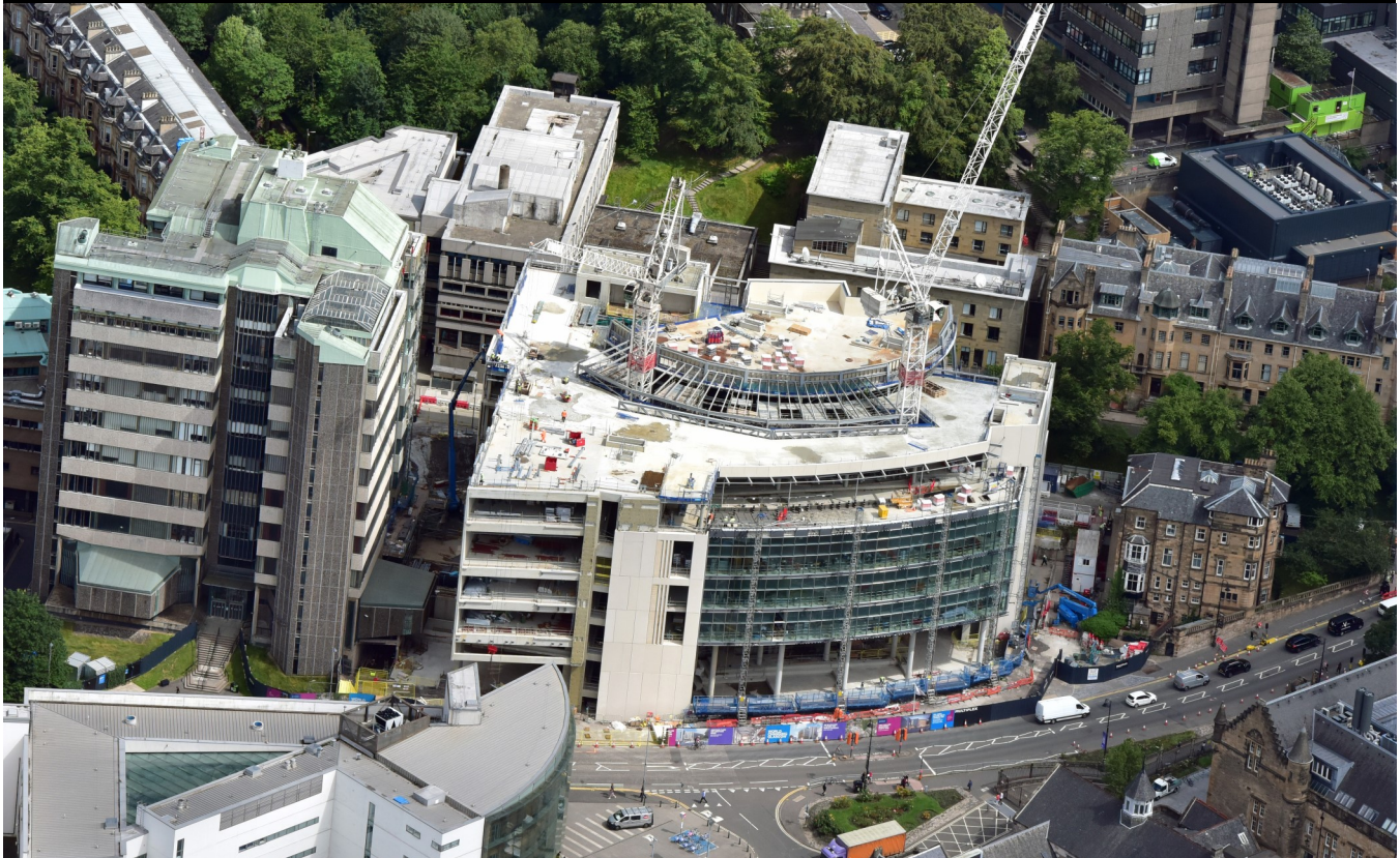
Western Campus - July 2019