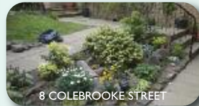
8 COLEBROOKE STREET